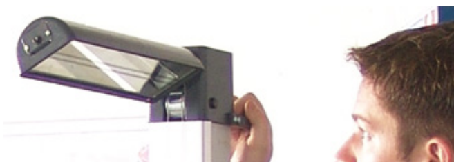
The unit is aligned with the vehicle by means of a mirror or, optionally, by using the laser pointer.